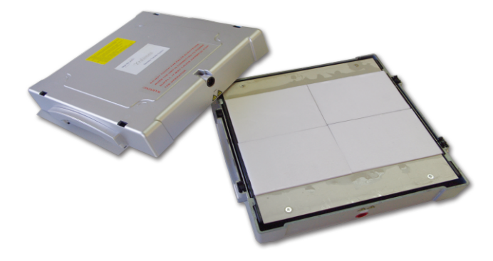
Stacking 4 sets of 7 x 10cm gel-membrane sandwiches.